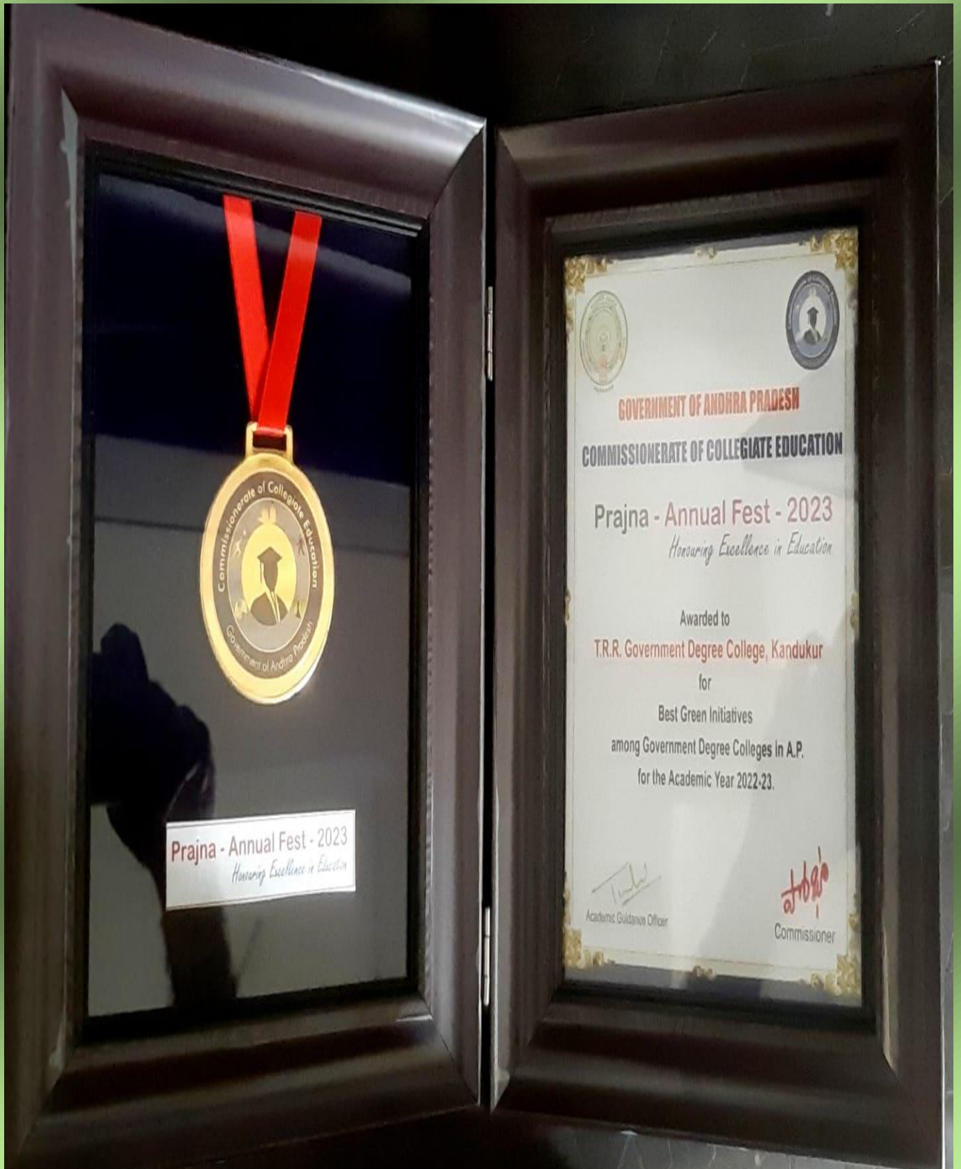
Certificate-Best Green Initiatives Award