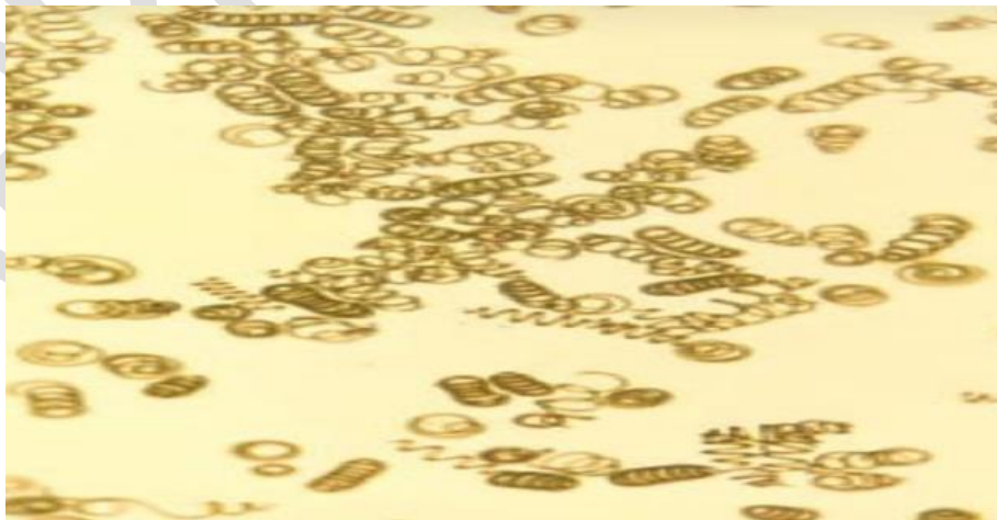
Plate 1: Microscopic Photograph taken by Dr. N. Tirupathi Swamy, Botany Lecturer, by using the bifocal microscope in Botany lab.

Note: The photographic evidence was shared by the Institute.