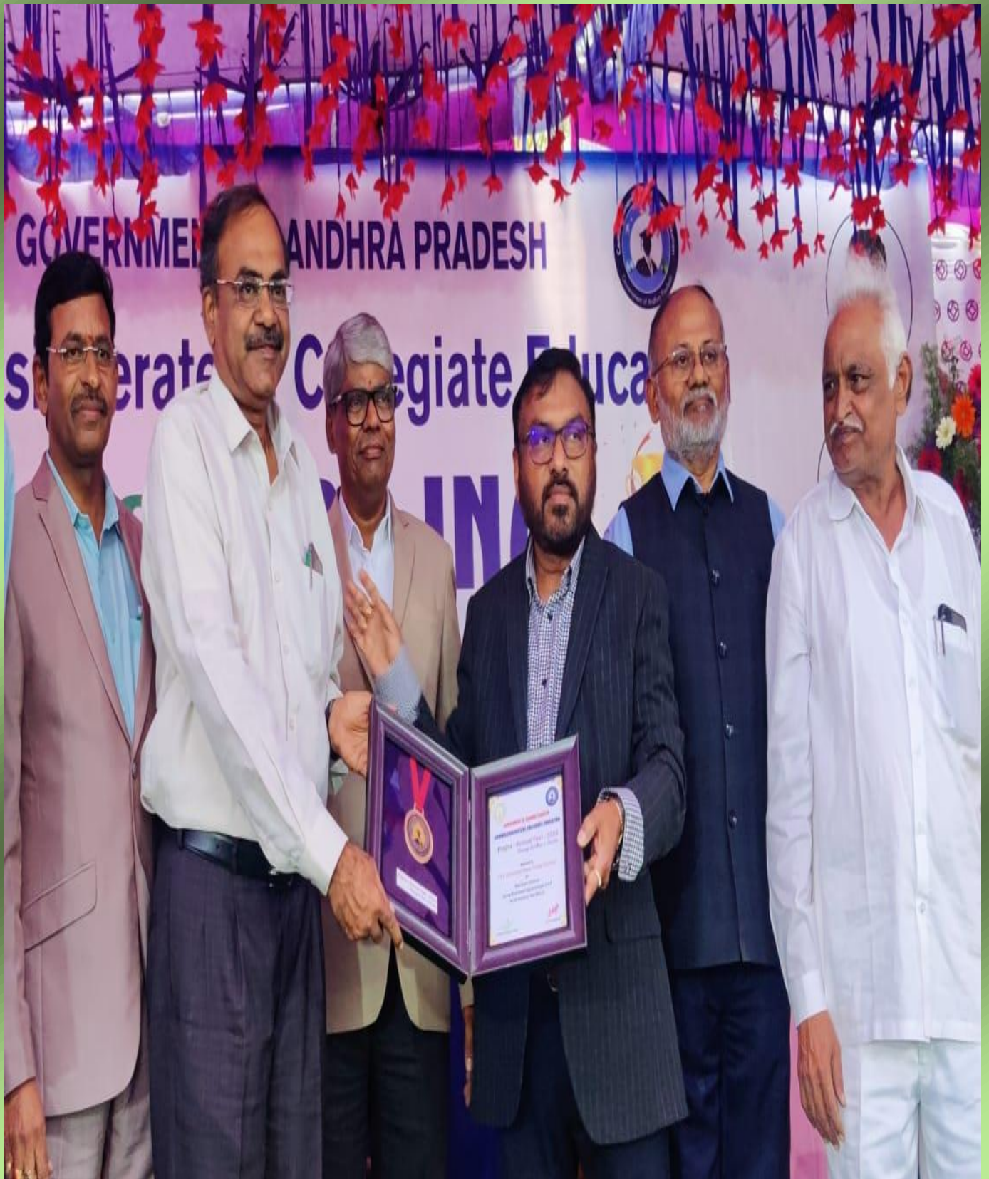
Best Green Initiatives Award from Commissioner